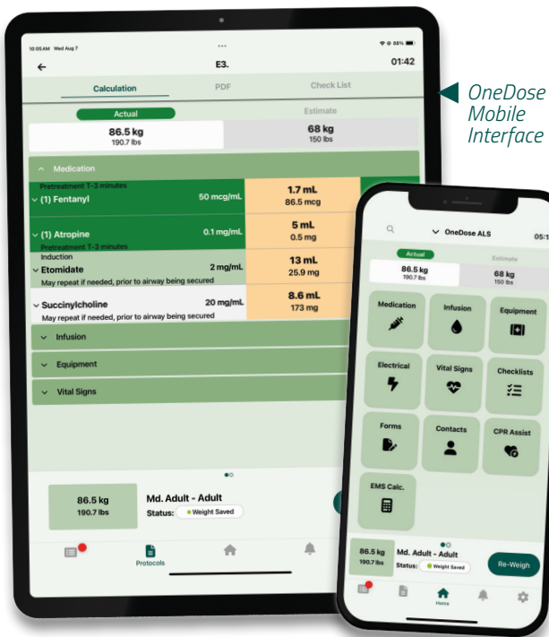
OneDose Mobile Interface